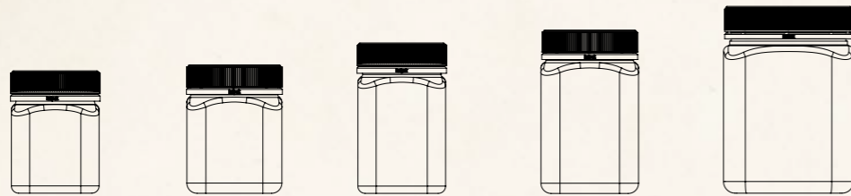
Square Jar 200ml (250gm) Square Jar 290ml (350gm) Square Jar 300ml (375gm) Square Jar 400ml (500gm) Square Jar 750ml (1kg)